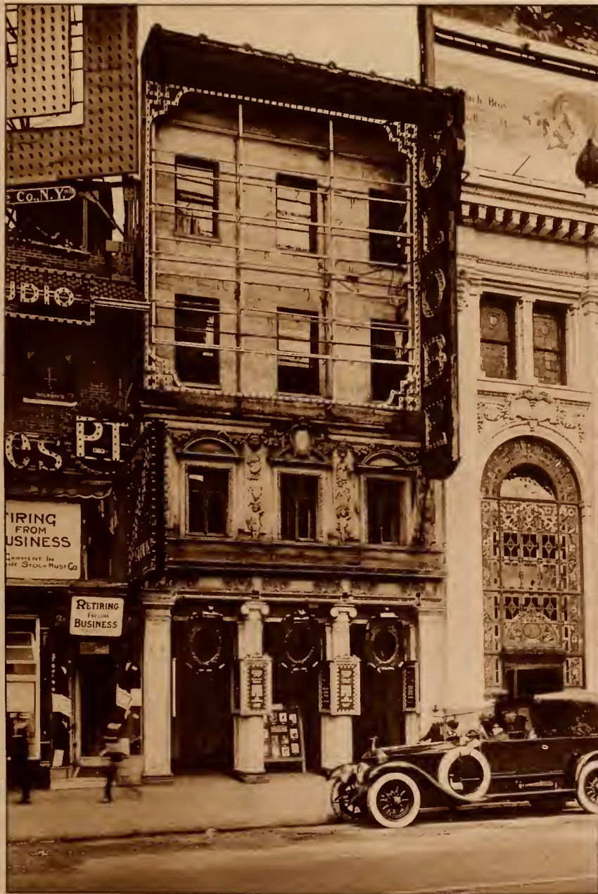
THE GLOBE THEATRE, situated on Broadway near 47th Street, considered the leading theatre in the musical comedy field. Has a seating capacity of 1190.